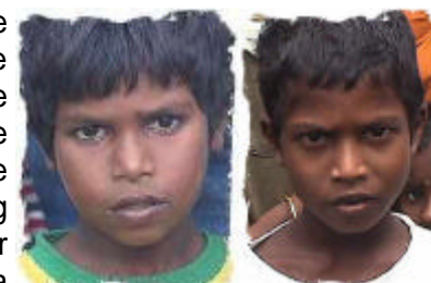
Orphan boys from tsunami area.

Please pray how the Lord would have you get involved in this home of refuge and for these children who are so special in Jesus' eyes. We may not be able to rescue every child, but we can start reaching out to twenty-four of these precious children. Each day that goes by, there is a child that is alone suffering, hungry, feeling rejected, and without any hope for his or her future. Together, we can give these orphans a new happiness in this life, and hope for eternal life. Help us put a smile on their empty faces by