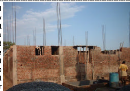
The orphanage up to the lintels.

them to work as early as seven years old. If this happens, the child will have to work hard at jobs others do not want, such as cleaning up cow waste, and other unsanitary jobs. This may still only allow them to eat once a day. Independent Church in India wants to make a big difference in these children's lives. Not only will they get a healthy and balanced diet, but also education, medical provision, toys, and clothing. These orphan children are desperately starving for love and acceptance. At their new home we will make sure they receive the love and care they so much deserve. We will diligently teach them about the Lord Jesus Christ and how to live a godly life in Him. This home will provide for twenty-four children, twelve boys and twelve girls, as we get sponsors for them. This building can also be added