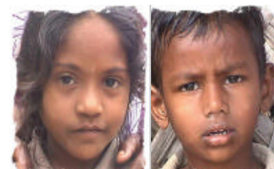
Orphans at remote villages.